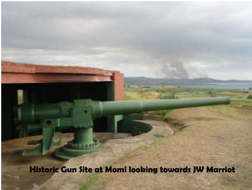
Historic Gun Site at Momi looking towards JW Marriot

Compiled by: Kingdom Real Estate Limited (License 82)