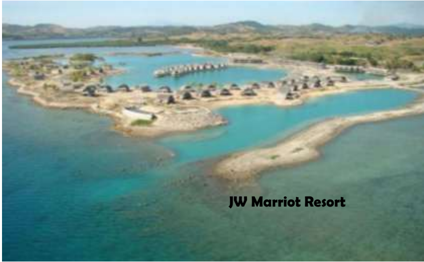
JW Marriot Resort