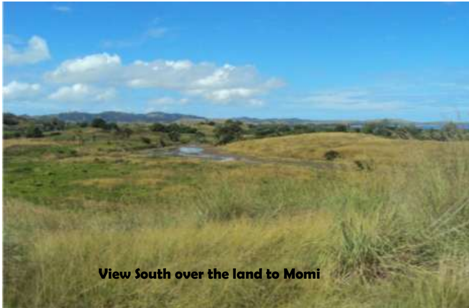
View South over the land to Momi

Compiled by: Kingdom Real Estate Limited (License 82)